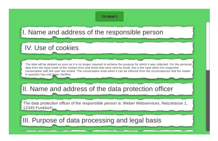
Figure 3: Minigame: Sorting Snippets of a Privacy Policy

As in every adventure game, Dave has to finish tasks to proceed in the game. Besides tasks incorporated in the main game, there are two tasks implemented in mini games. When Dave meets the data protection office of his company in exchange for advice, the data protection officer asks Dave to put together a torn data protection declaration (cf. Fig. 3). The snippets of the data protection declaration must be put in the correct order using drag and drop. The snippets each consist of a heading of the data protection declaration and the corresponding explanation. If the snippets are lined up correctly, the player may proceed with the main game; if the order is incorrect, he will be asked to edit them again. Solving all tasks along his way will lead Dave to the castle of the data leech, where he has the possibility to retrieve his personal data. But before Dave can enter the castle of the leech, he has to prove his knowledge by passing a quiz (cf. screenshot in right corner of Fig. 4). The quiz is based on the GDPR and after answering each question, the players get feedback on their answers. The player needs to answers at least half of the questions correctly to be allowed to enter the data leech's castle.