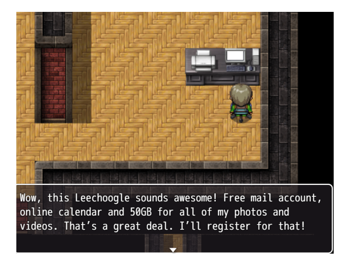
Figure 2: Start of the Main Game

this service without reading the respective privacy policy and because of his enthusiasm he wants to tell everybody about it. Already in his first discussion, he realizes that this service does not only have advantages. During his adventure he interacts with lots of interesting people who demonstrate him the disadvantages of ignoring the terms of the privacy policy. Even at night the guilty conscience does not let go of him. In his dream, Europa (hero figure) appears to him, who draws his attention to the right to erasure (GDPR) and encourages him to travel to the castle of the leech (antagonist and boss) to get the data back.