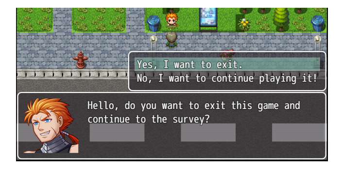
Figure 7: A Reporter Allows the Player to End the Game

So far we have run two pre-tests. The first one with 12 researchers from Goethe University and the second one with 6 persons with a mixed background. In general the feedback was positive and most players liked the game and those who were not already aware beforehand, confirmed that they learned about privacy policies. As a result of the feedback, we have also improved the instructions, i. e. with some explanations for non-experienced players, we have fixed some